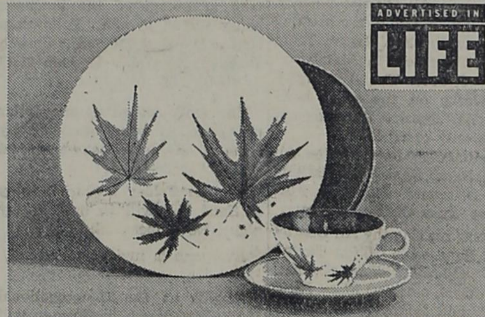
"Harvest Time" Pattern. One of many to choose from.

FAMOUS Iroquois True China NOW GUARANTEED THREE FULL YEARS