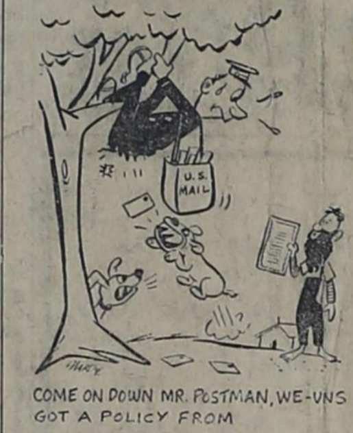
COME ON DOWN MR. POSTMAN, WE'VE GOT A POLICY FROM