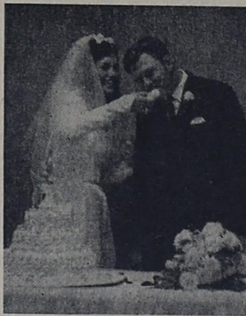
From The Vidor Vidorian —