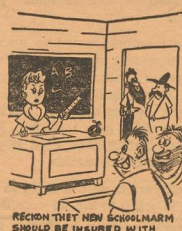
RECKON THEY NEW SCHOOLMARM SHOULD BE INSURED WITH