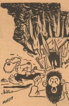
WAW! BETTER HAVE PAW GIT THE FIRE INSURANCE FROM...