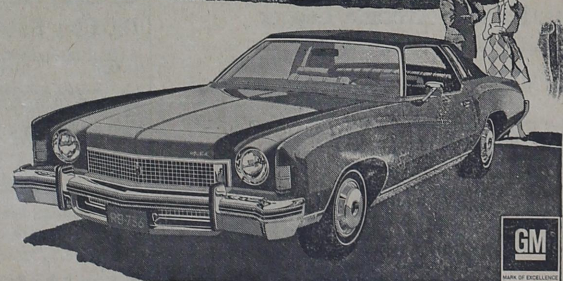
(above) Caprice Coupe. Our new uppermost Chevrolet. Its luxury, comfort and quiet ride rival the most expensive cars you can buy.