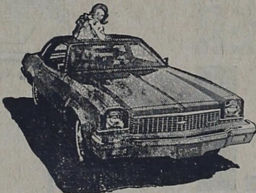
New Nova Hatchback Coupe.

It's standard on all big Chevrolet, Chevelle and Monte Carlo