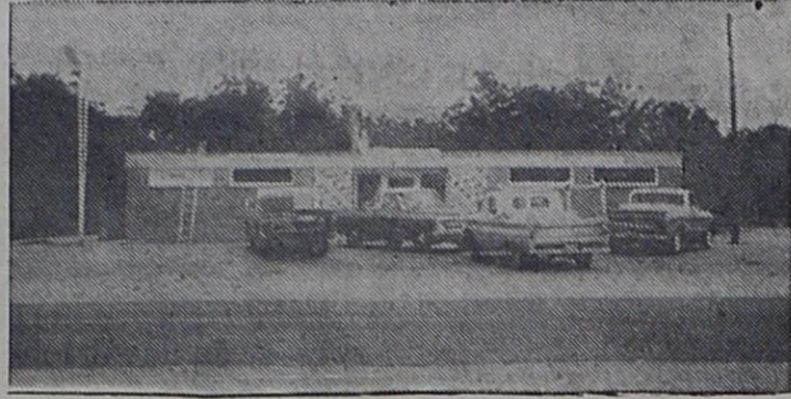
LOCATED ON HWY. 6 WEST — GORMAN