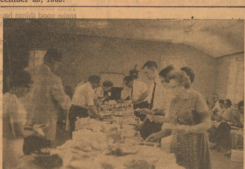
LEON HOMECOMING — The above scene was the main attraction at the Leon School Homecoming held Sunday, July 19 at the Fire Hall. This was the 8th annual event.