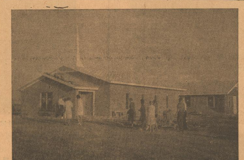
NEW KOKOMO BAPTIST CHURCH ALMOST COMPLETED — Kokomo citizens view the new Baptist Church building when they gathered recently to organize the Farm and Home Community Improvement Program. The new building replaces the church building that was destroyed by fire on December 29, 1969.