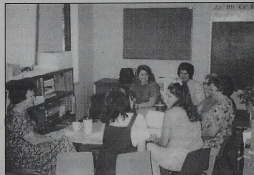
TEACHER PLANNING SESSION — Shown above are some of the teachers at Maxfield Elementary discussing the teaching schedules for the new school year beginning on August 17th.