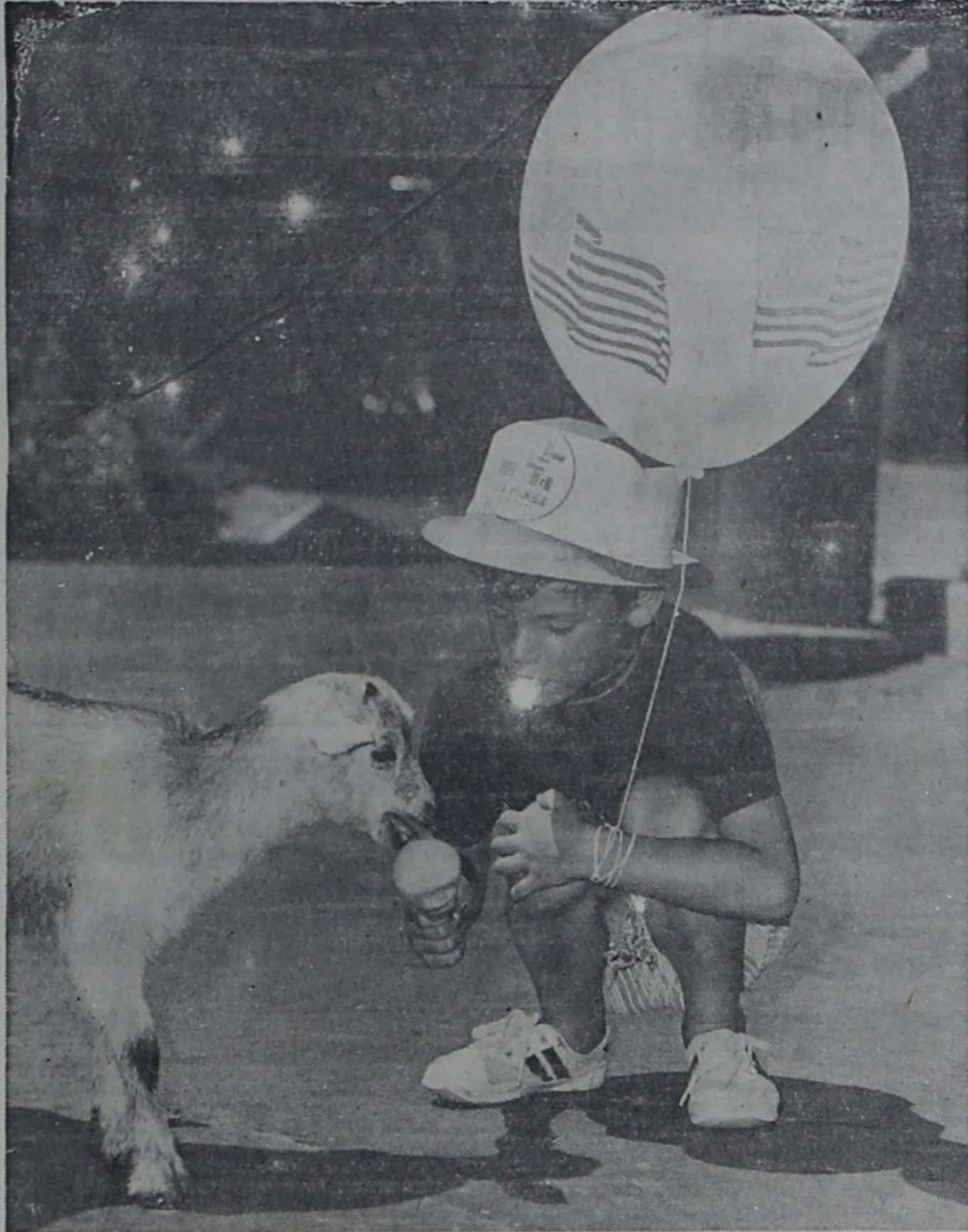
KIDS WILL BE KIDS - A young visitor to the petting zoo at Six Flags Over Texas proves for himself that goats don't limit their diet to tin cans. The share-and-share-alike plan did work. After the photo was snapped, the baby goat made off with the whole ice cream stick and all.