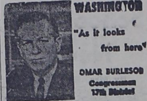
WASHINGTON, D. C. — IT