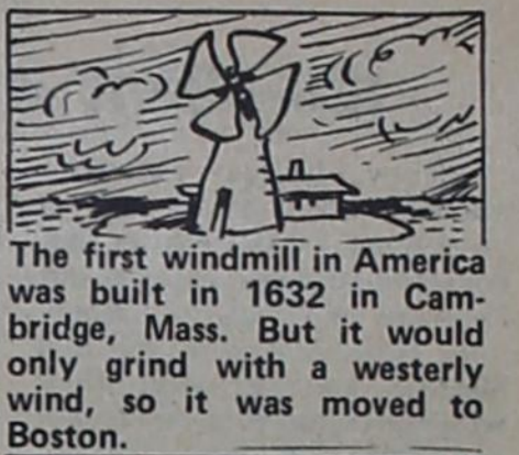
The first windmill in America was built in 1632 in Cambridge, Mass. But it would only grind with a westerly wind, so it was moved to Boston.

You can't leave now and only allowed 3 short visits back at your old home in Kermit. We all enjoy having you both here. They are parents of Pat Buckley.