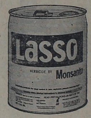
Lasso is a registered trademark of Monsanto Company. Always read and follow the label directions for Lasso.

Reduce competition from it with Lasso® herbicide at the full labeled rate for your soil type, shallowly incorporated according to label instructions.