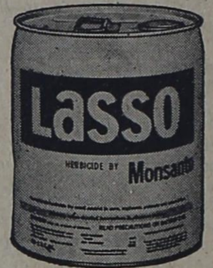
Lasso Herbicide is a registered trademark of Monsanto Company. Always read and follow the label directions for Lasso.