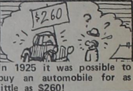
In 1925 it was possible to buy an automobile for as little as $260!