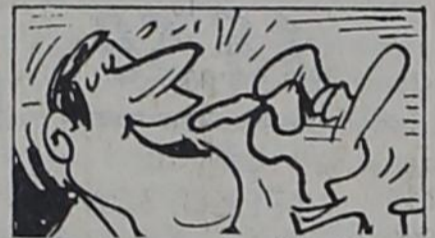
According to the U.S. Dept. of Agriculture, the average American eats 8 1/2 pounds of pickles a year.

Shellers must complete negotiations for further imports under the relaxed quota by June 15.