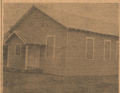
IMPROVEMENT AT KOKOMO COMMUNITY CENTER — Shown above is the Kokomo Community Center after the remodeling project was completed recently.

The Kokomo Community is one of the ten communities in District 8 to be toured and judged on improvement projects, after having submitted a record book for judging in March. There will be three out of town judges, two district agents and our county agents coming for the tour and we hope a host of our friends from the surrounding towns and communities will also join us on the tour.