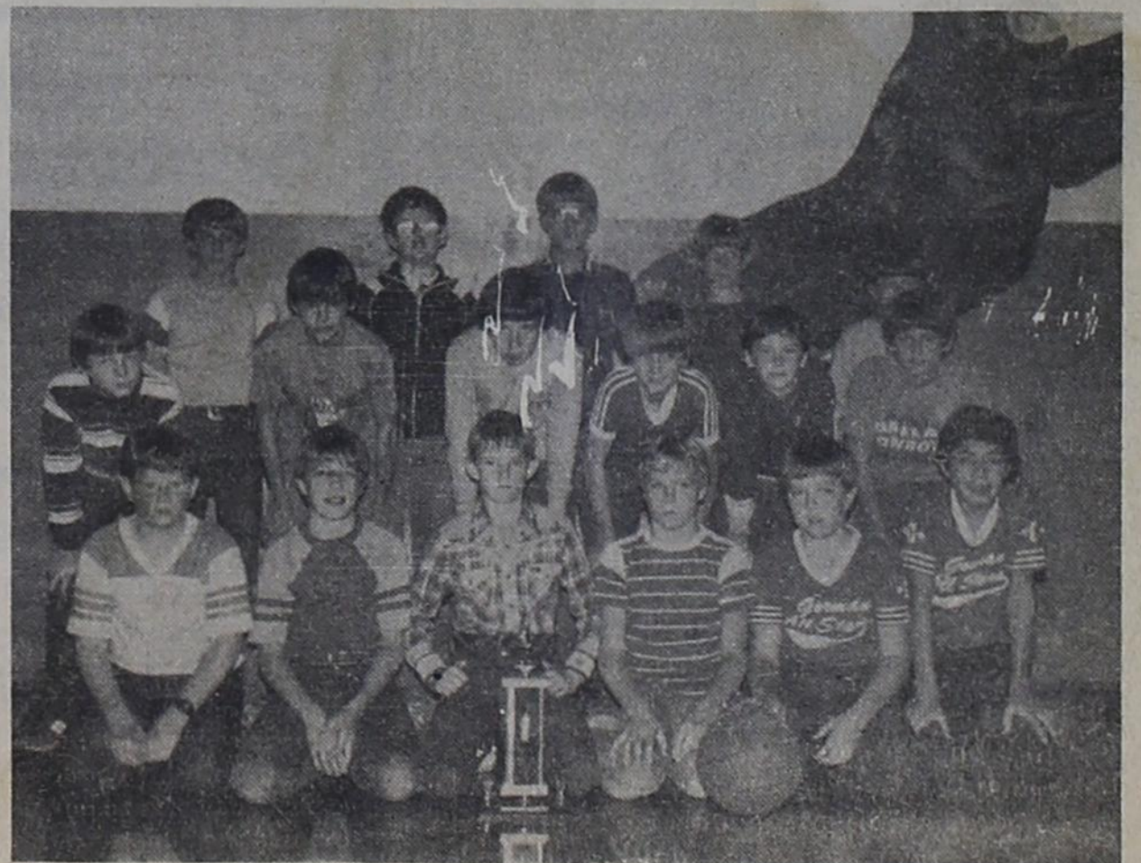
WINNERS OF RANGER PEE WEE TOURNAMENT