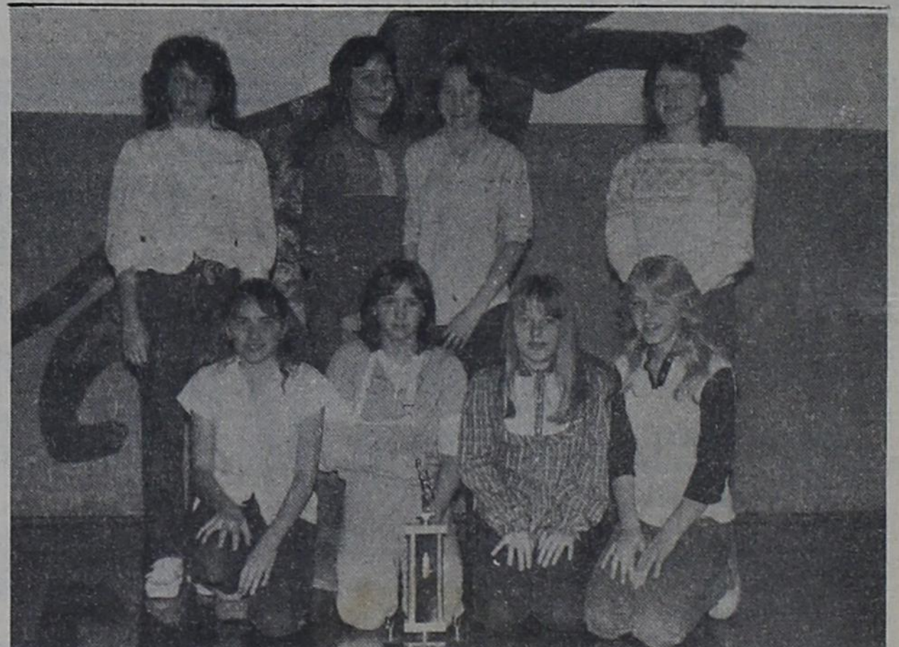
WINNERS OF RANGER PEE WEE TOURNAMENT

Born December 29, 1892 he raised his family in