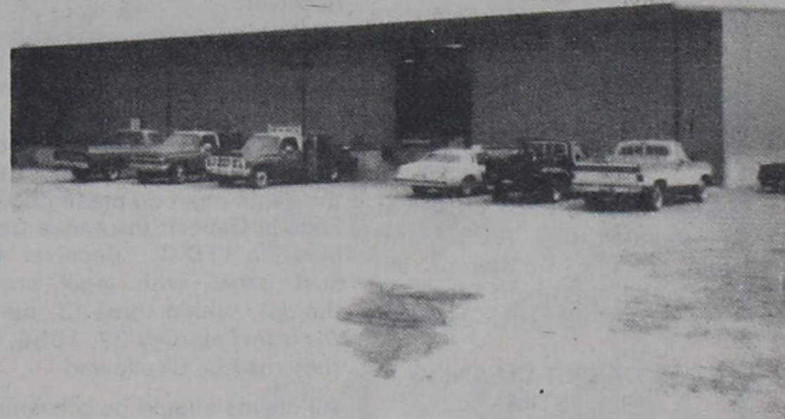
NEW FACILITIES AT PEANUT CORP. OF AMERICA - Shown above is the exterior view of the new expansion at Peanut Corp. Work is continuing on the interior portion of the plant. Photos of the interior will be made as soon as the project is completed.