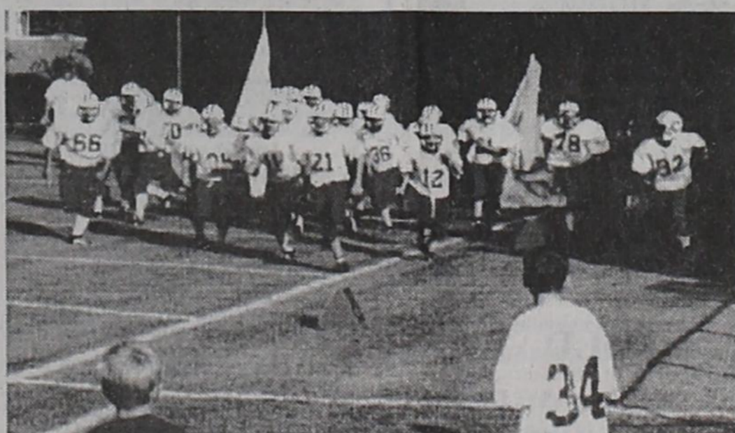
Gorman Junior High Football Picture taken at Albany game on September 16th

The Annual Beattie Quilting Club Show and Sale will be Saturday, October 2 from 9 to 5 at Beattie Community Center. Door prizes will be given. Refreshments will be available for a nominal fee. Come browse and enjoy the activities.