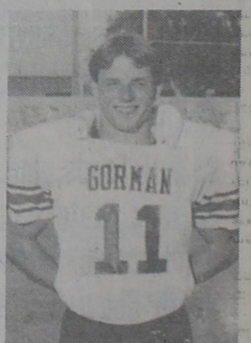
Robby Hand Striker Award