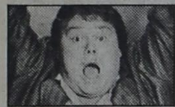
HBO COMEDY HOUR: LOUIE ANDERSON