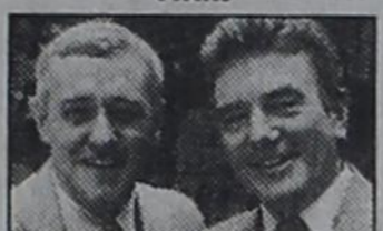
HBO ORIGINAL MOVIE: THE IMAGE