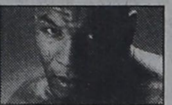
WORLD CHAMPIONSHIP BOXING

When the chill of Old Man Winter starts to get under your skin, snuggle up with the hottest movies around. They're on HBO, naturally. See movies like "Rain Man," "Twins," "The Naked Gun: From the Files of Police Squad!" and "Working Girl." And that's not all.