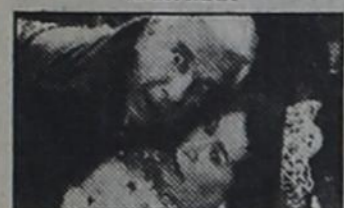
THE NAKED GUN: FROM THE FILES OF POLICE SQUAD!