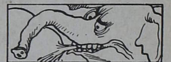
When female elephants fight, it is said, they usually try to bite off each other's tail.