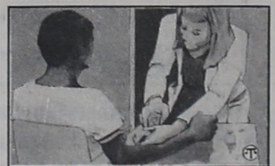
Getting tested for HIV may mean more hope and better health.

People infected with the Human Immunodeficiency Virus (HIV) who receive early treatment can greatly improve the quality and length of their lives, experts agree. They can delay the onset of AIDS and may do well long after those who ignored their health have serious illnesses or early death. When people first acquire HIV, they often feel healthy and are unaware that they have been infected until they have a blood test.