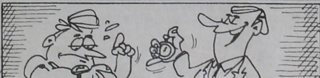
Studies show English speakers dislike a conversational lull of over four seconds and try to fill the gap.

By submitting this ballot, I attest that I meet the criteria to vote.