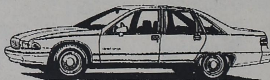
Caprice Classic LTZ Sedan

NOW ONLY $274.97 A MONTH FOR 48 MONTHS WITH OUR SMARTLEASE PROGRAM!! AVAILABLE UNTIL APRIL 7, 1991.