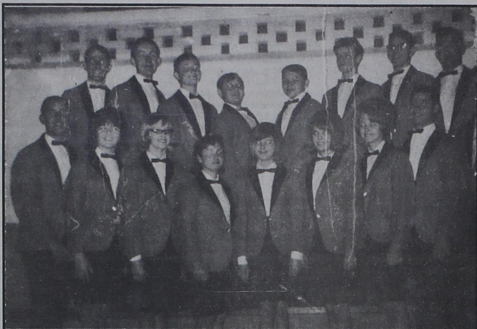
We hope that this picture of the students above brings back memories of fun times at ole Gorman High School. We hope that you can identify some of them.