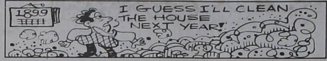
The first vacuum cleaning devices were developed about 1900.

Texas Extension Agent-HE. After the meeting the group was given the option of touring the Highlands Mansion in Marlin. The Eastland County group enjoyed the tour before returning home.