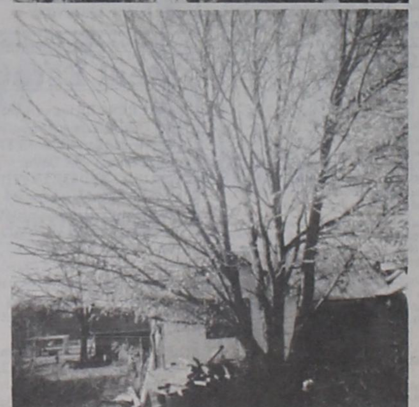
NEW LEAF CROPS — Top Photo shows the new crop of leaves appearing on a cottonwood tree and the lower photo shows the new leaves on a maple tree at the home of Virgie Dennis. She stated that one crop of leaves was enough leaf raking to do without another crop.