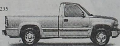
6000 V8, HD 4 spd Automatic Transmission, Air, Cruise, Tilt, AM/FM Cassette, Locking Differential

MSRP ..... $25,049 Bayer Discount ..... 2,337