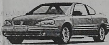
4 Speed Automatic, AM/FM Stereo w/CD, Cruise, Tilt, Air, Rear Deck Lid Spoiler

MSRP ..... $18,220 Bayer Discount ..... 1,059 Total Savings ..... 3,059 Sale Price ..... $15,161 Plus T.T.&L.