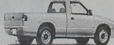
LS, 2200 L4 Cylinder, Cruise, Tilt, Deep Tinted Glass, Body Side Moldings, White Letter Tires

MSRP ..... $15,566 Bayer Discount ..... 1,124 Total Savings ..... 3,624