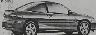
4 Speed Automatic, Sport Package, Air, AM/FM Stereo w/CD

MSRP ..... $15,145 Bayer Discount ..... 554 Total Savings ..... 2,554 Sale Price ..... $12,591 Plus T.T.&L.