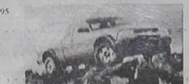
Extended Cab, LS, 4300 V6, 4 spd Automatic, Cruise, Tilt

MSRP ..... $20,046 Bayer Discount ..... 1,588