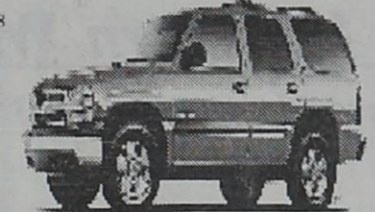
LT, Third Row Seating

MSRP ..... $37,433 Bayer Discount ..... 3,698