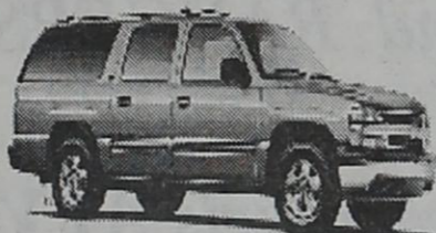
LT, Lift Gate, White Letter Tires

MSRP ..... $39,448 Bayer Discount ..... 4,140 Total Savings ..... 6,140 Sale Price ..... $33,308 Plus T.T.&L.