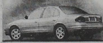
3.5 Liter V-6, 4 Spd Automatic, Air, Remote Keyless Entry, 6 Way Power Driver Seat, AM/FM Stereo Cassette & CD Player

MSRP ..... $23,595 Bayer Discount ..... 1,439 Total Savings ..... 3,439 Sale Price ..... $20,156 Plus T.T.&L.