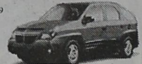
3400 V-6, 4 Spd. Automatic, AM/FM Stereo w/6 Compact Disc Changer, Trailer Tow Package

MSRP ..... $32,604 Bayer Discount ..... 2,132 Total Savings ..... 3,132 Sale Price ..... $28,472 Plus T.T.&L.