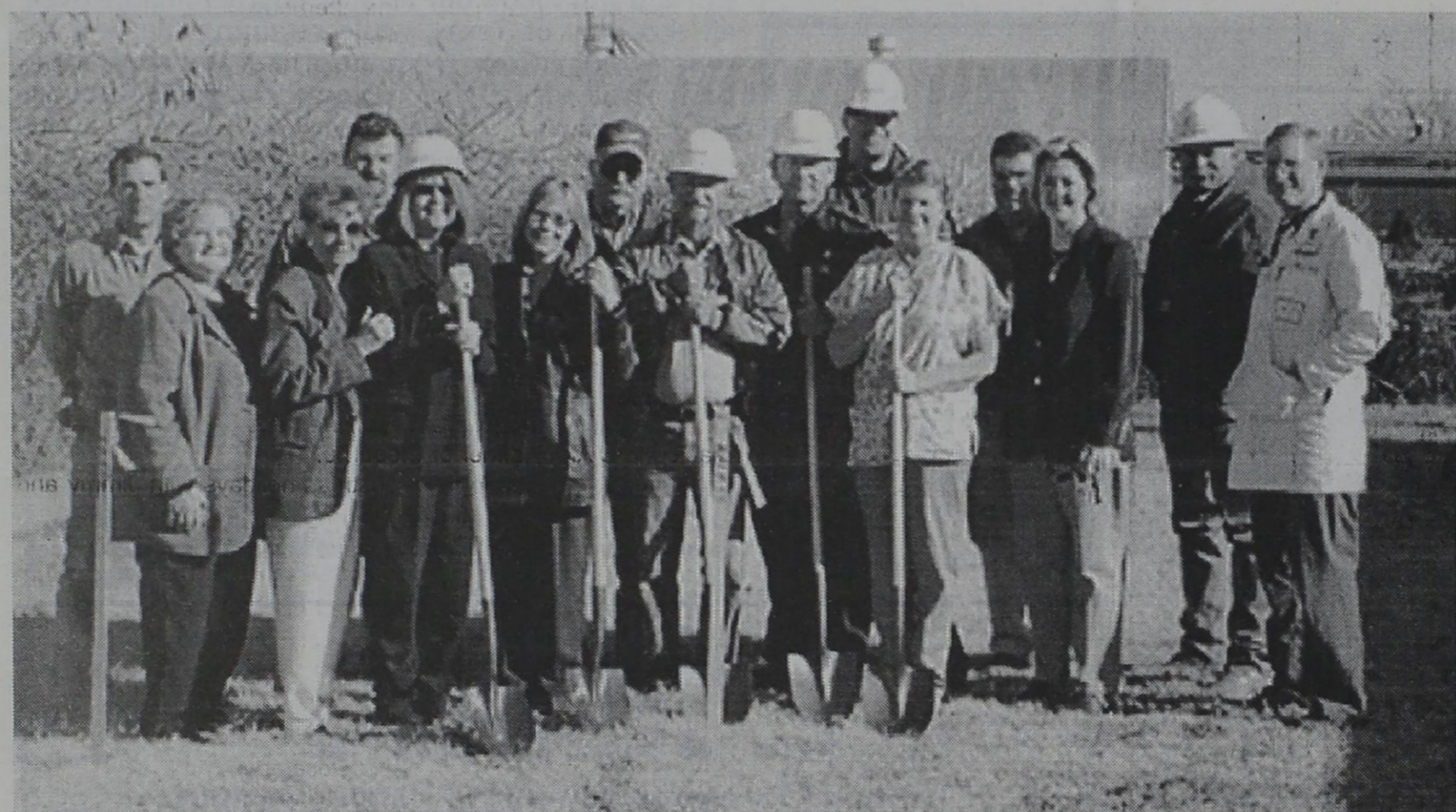
Photo above shows all of the visitors during the ground breaking ceremony held recently in Gorman.

Please note that scheduled show times may be subject to change (ahead or behind). The Gorman Livestock Raisers Association sponsors a concession stand located in the cafeteria. Proceeds benefit Gorman students at the Eastland County Livestock Show premium sale.