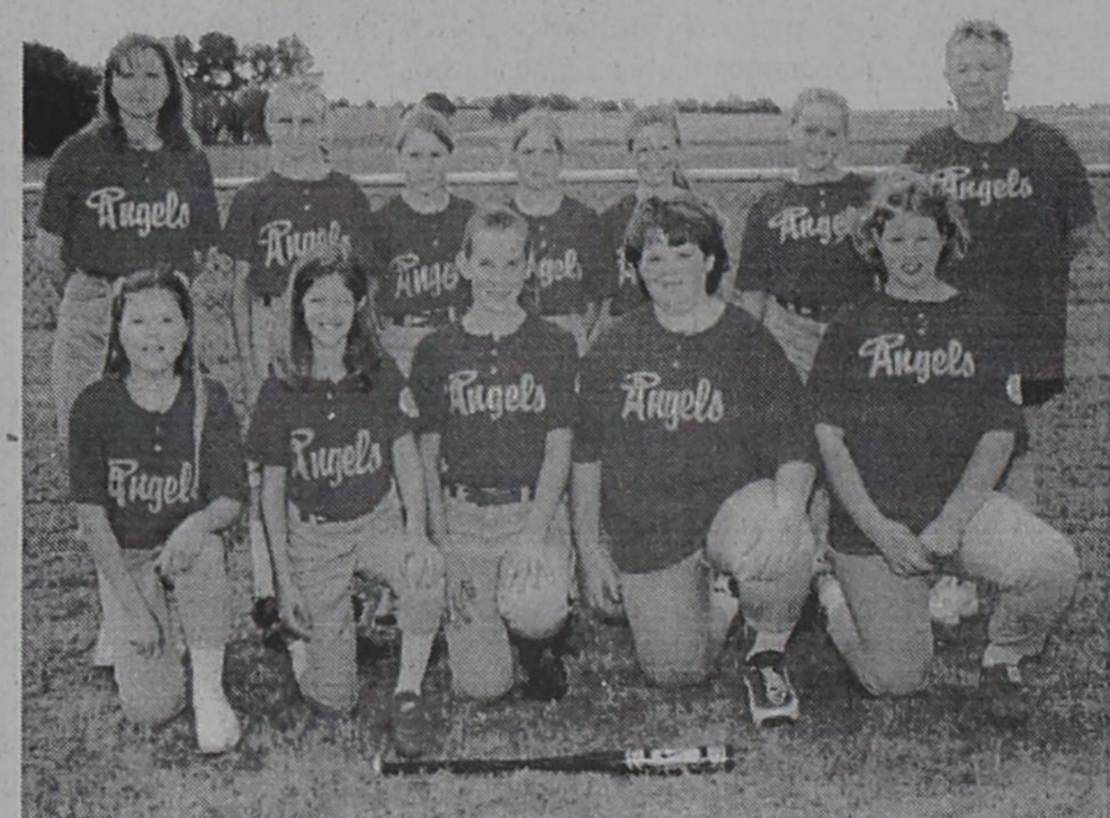
Girls Softball 12 and Under Angels Sponsor: Gorman Housing Authority