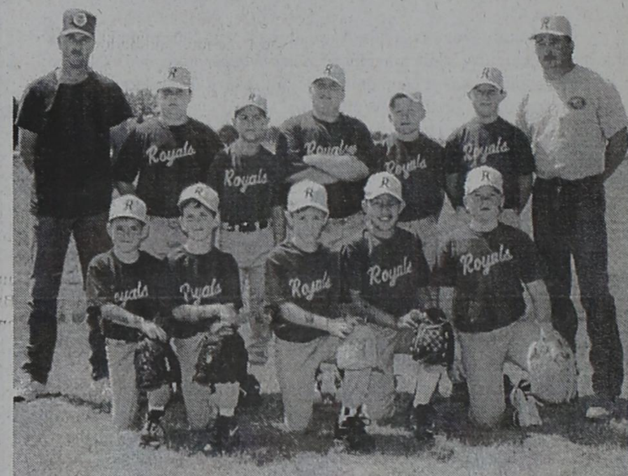
DeLeon Major League Baseball Royals Sponsor: American State Bank 2nd place overall