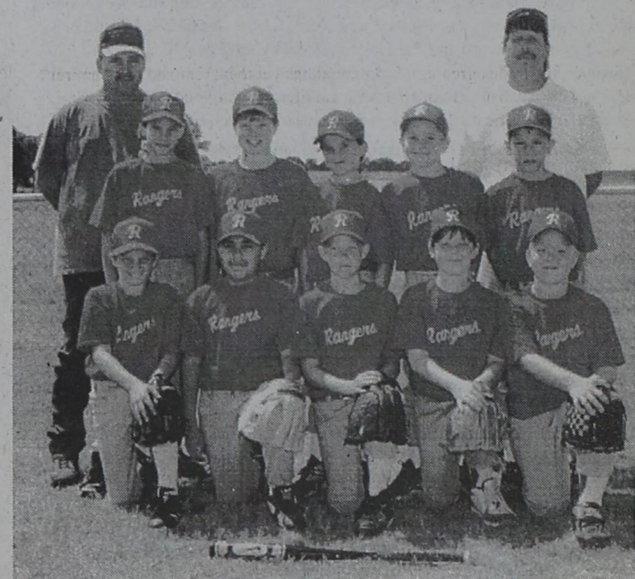
DeLeon Major League Baseball Rangers Sponsor Bayer Motor Co. 3rd place (tie) overall