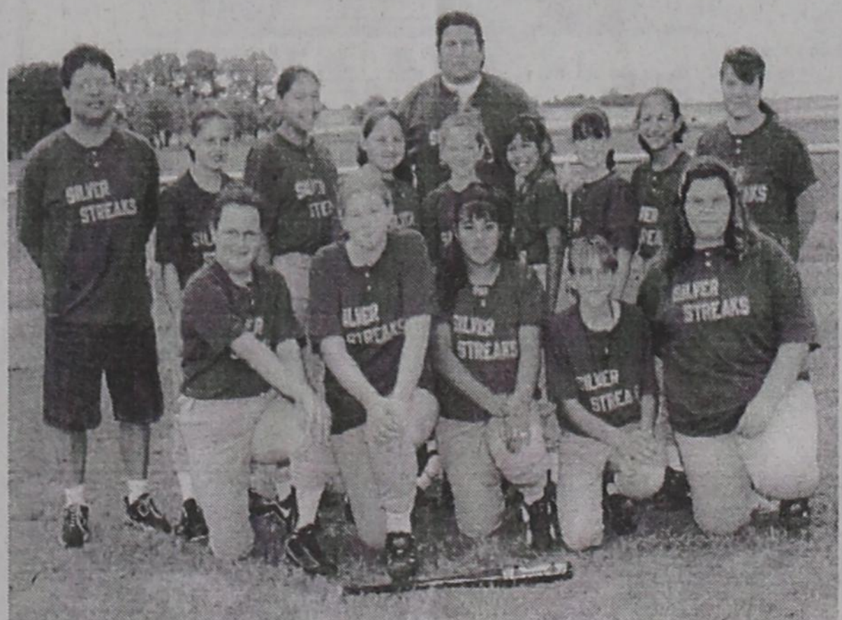
Girls Soft Ball 12 and Under Silver Streaks Sponsor: Gorman Milling