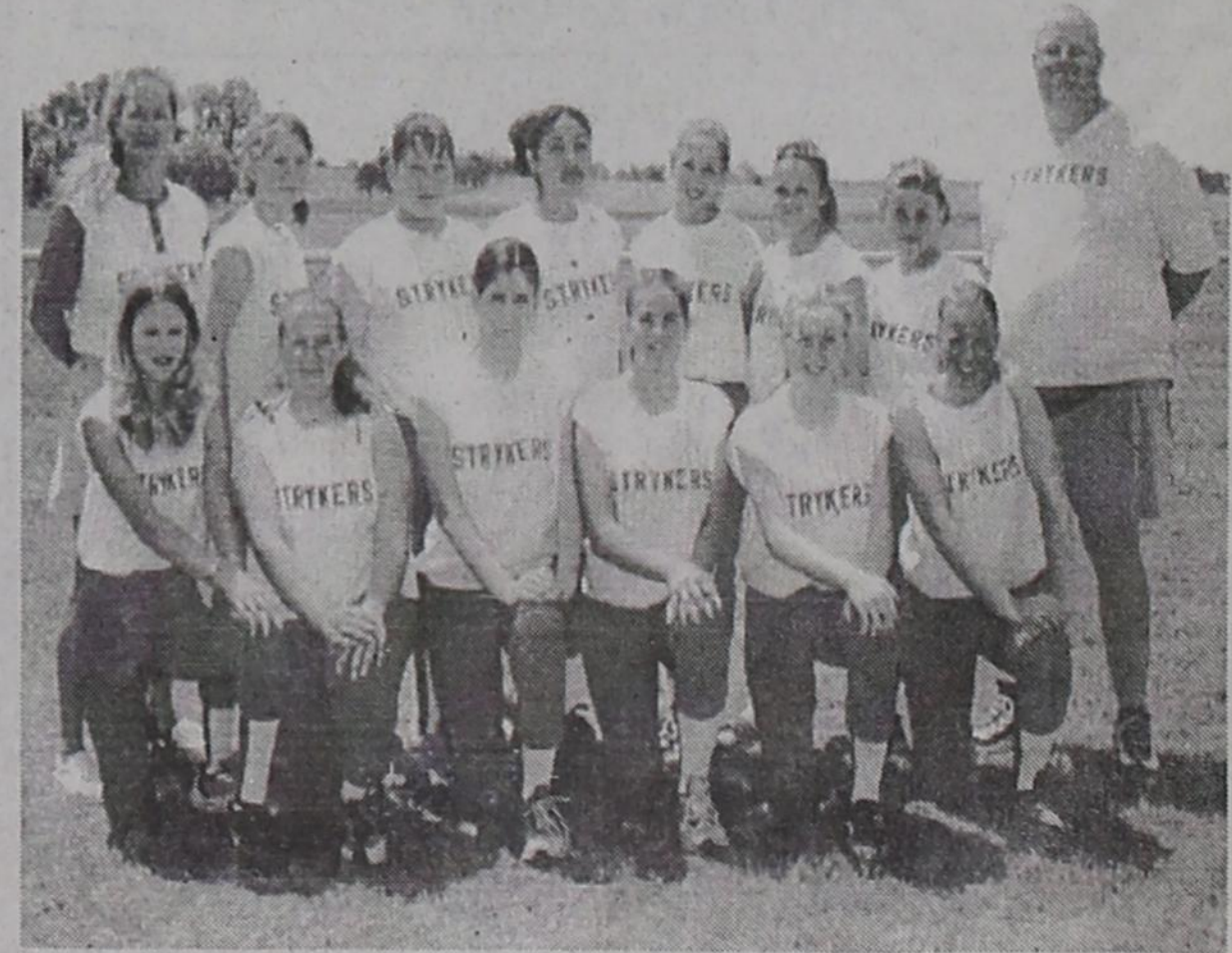
Girls Softball 14 and Under Strykers Sponsor: Norton's