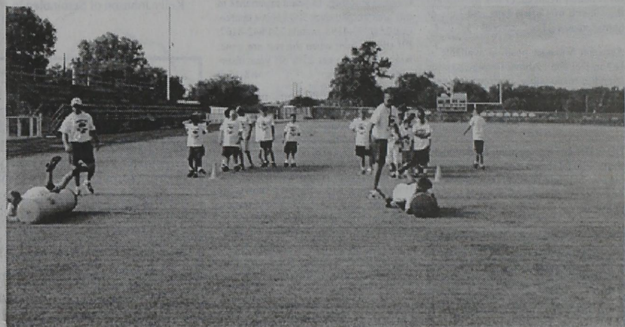
TACKLING DUMMIES - The group of players during the camp really enjoyed the part of tackling the dummies, some hit the tackling dummies to pound them in the ground and others were pounded by the tackling dummies. All reported enjoying the camp.