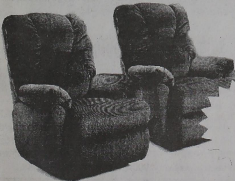
BLASTER CHAISE RECLINER