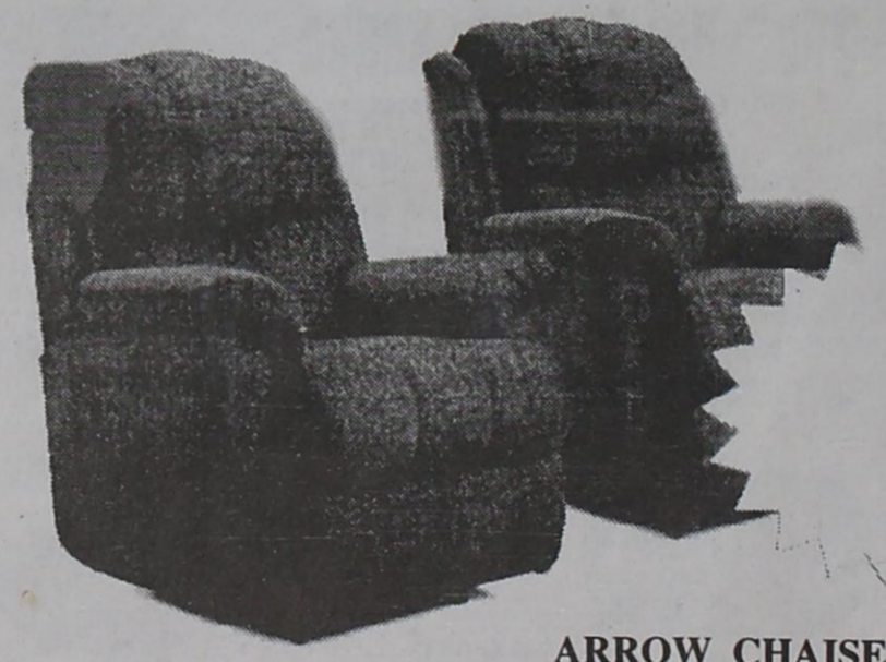
ARROW CHAISE RECLINER W/STORAGE ARM & CUP HOLDER