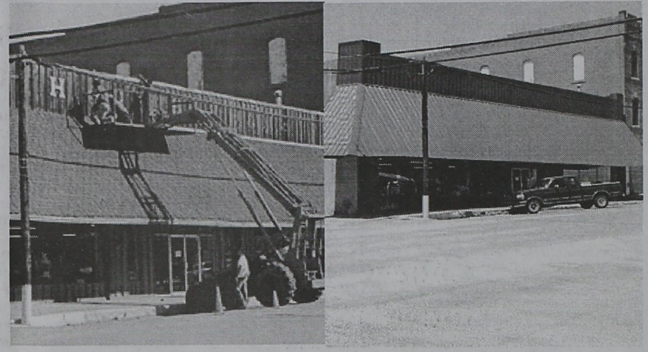
City Crew Removing Old Cracked Concrete To Make Room For New

The Photos below show Revise Laminack and his crew taking down the last of the letters from the original Higginbotham's sign above the awning on the old Higginbotham building. The front awning was soon replaced with a new red metal front on the building.