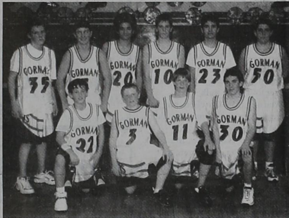
8th Grade Boys — District Champs