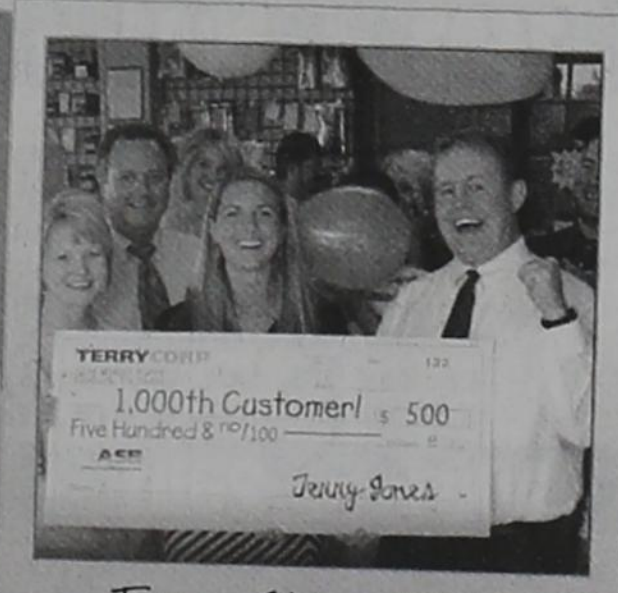
Terry: Chose ASB

Business is a numbers game, and choosing the right bank can have a big impact on more than just your bottom line. If you're looking for a bank that offers quick turnaround on your business loans, you need ASB Business Banking. Being a bank with local roots means ASB business bankers make decisions faster, which can have a big effect on your business.