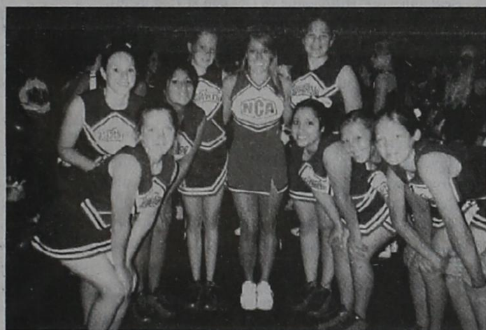
GHS Cheerleaders shown with their NCA Staff Buddy.

the highest squad performance ribbon given at camp. The second day evaluation is on a cheer with a jump and a chant that has been learned that day at camp, the girls received superior ratings on both the cheer and the chant. The third day evaluation is a cheer with a stunt and a different chant from the previous day. Again, the girls brought home two blue superior ribbons. On the final evaluation on the fourth day we decided to go all out and try a stunt that had been giving us trouble all week. The girls incorporated into their cheer a one legged liberty stunt and jumps. And once again the