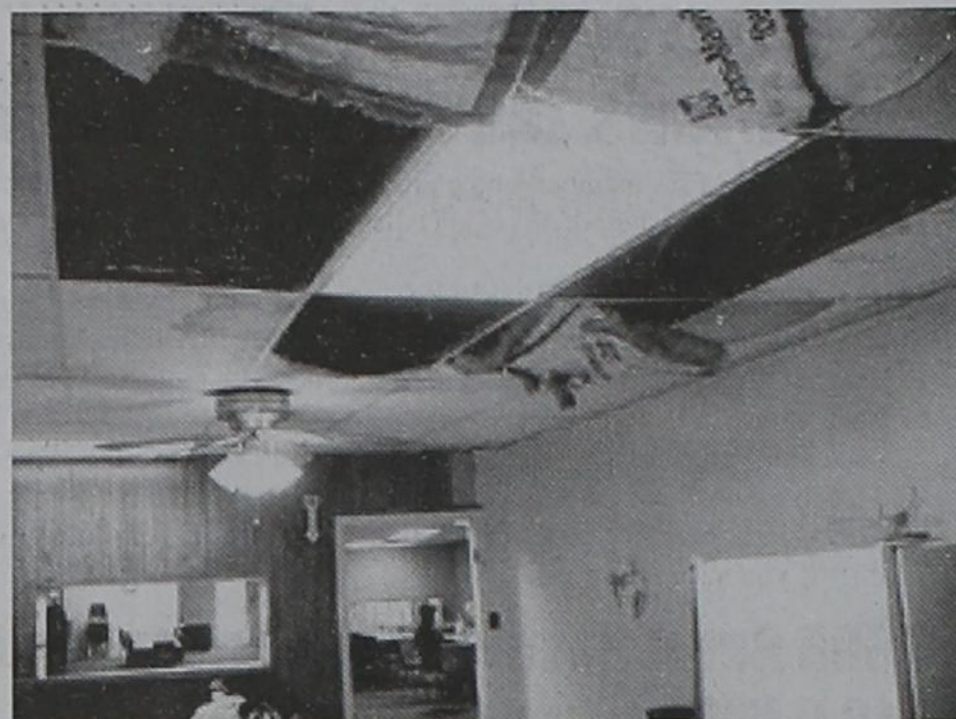
Ceiling in Senior Citizens Center in Need Of Repairs. The roof was repaired last week.