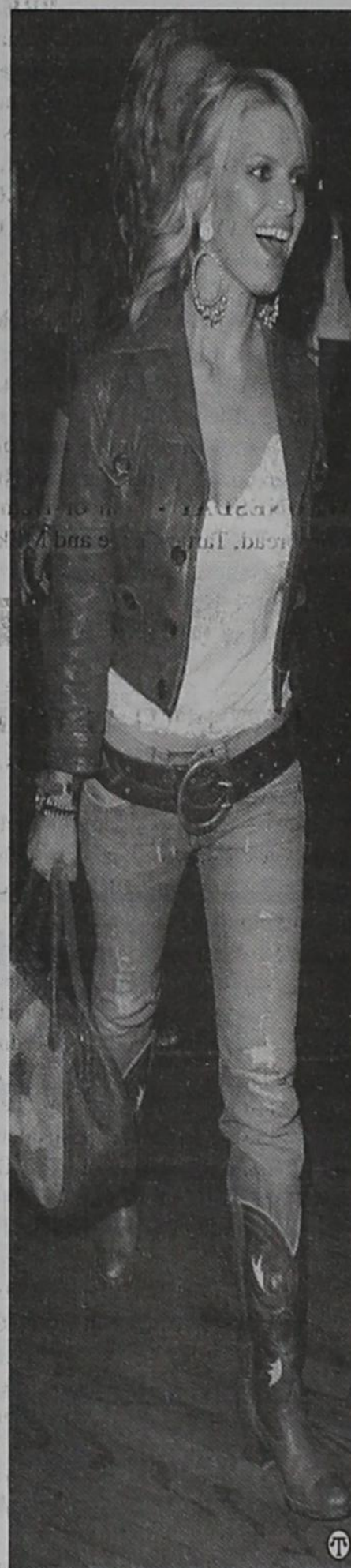
Jessica Simpson is among celebs helping make cowboy boots hot.

For more information, visit www.Shoebuy.com .