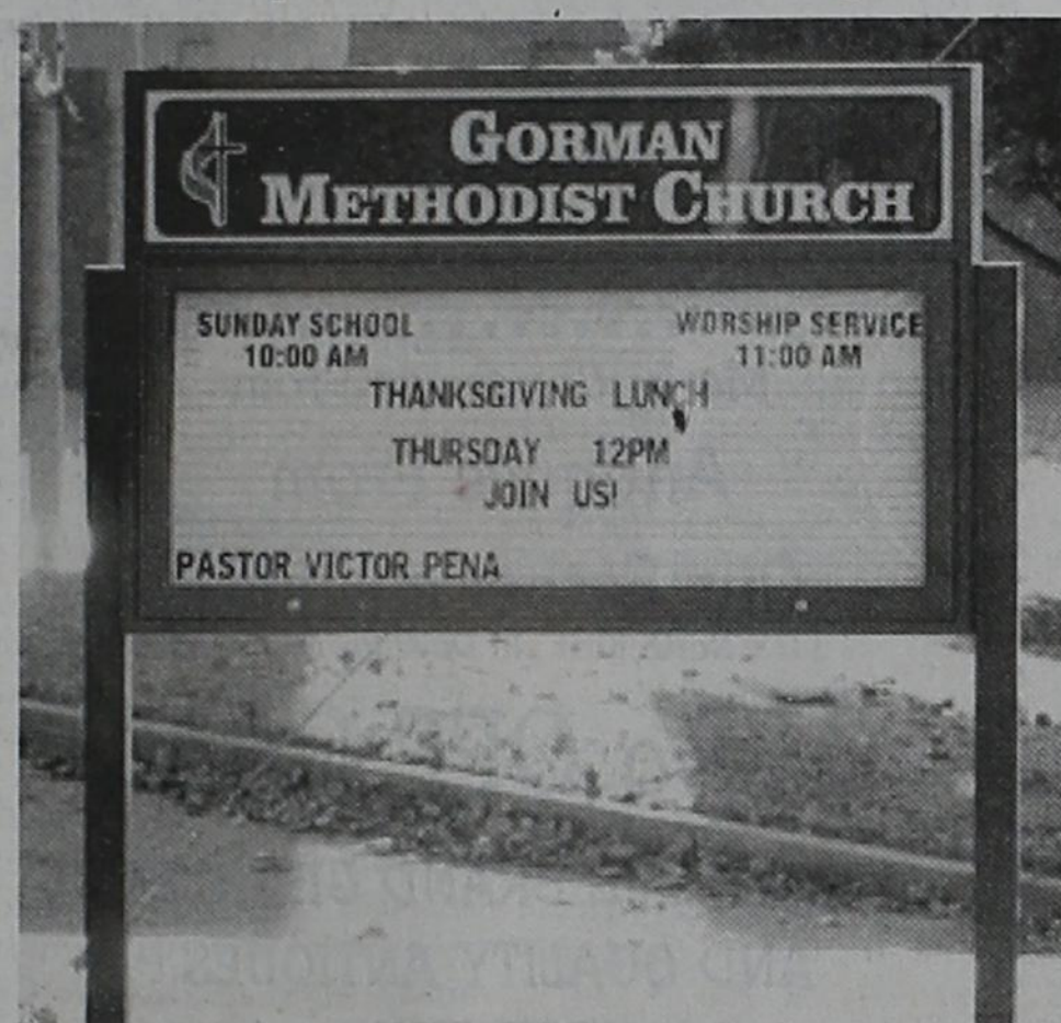
Look what's new at the Methodist church! Drive by and see the ongoing improvements we are making and join us for Thanksgiving Dinner Thursday at noon!