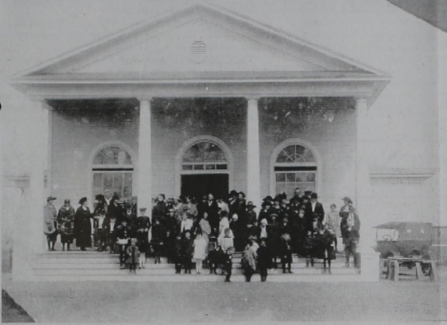
First Baptist Church of Desdemona is a small rural church ministering to the needs of the Desdemona Community.