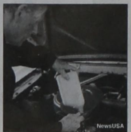
A little maintenance can go a long way.

• Get your car on a "daily vitamin" routine: Like taking vitamins, there are basic checks that everyone should perform regularly on their car. Make sure to check the tire pressure on all four tires — and the spare — at least once a month. To obtain an accurate pressure reading, your vehicle must be idle for three hours or have been driven for less than a mile at the time of testing. When tires lose air pressure, drivers lose miles per gallon and unnecessarily waste fuel, but avoid over-inflating tires because it is dangerous and will cause tires to wear prematurely. Did you know, for example, that a drop of eight pounds per square inch in your tires could result in 2 miles per gallon of fuel economy loss, an 18 percent loss in your vehicle's load carrying capacity and a 25 percent loss in tire tread wear? • Keep your car hydrated: In addition to tire pressure, it is important to check your vehicle's fluids. When your body becomes