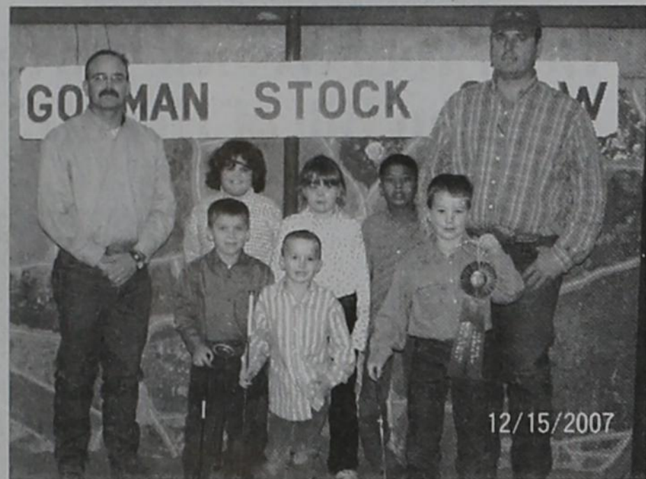
Pee Wee Showmanship