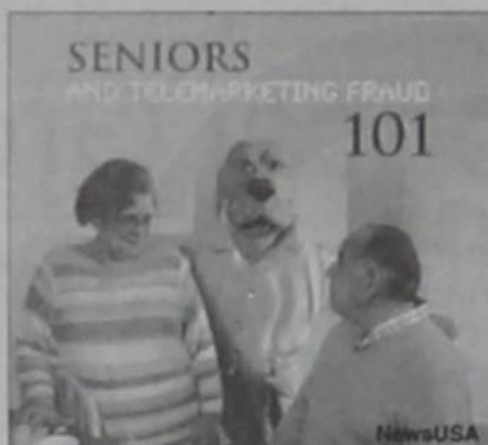
The National Crime Prevention Council provides this free brochure, featuring McGruff the Crime Dog, to help seniors steer clear of telemarketing fraud.

• If a caller asks for personal information such as a credit card number or Social Security number, say: "I don't give out personal information over the phone. I'll contact the company directly and provide them with the necessary information." Then hang up.