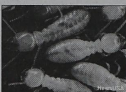
Termite colonies can destroy carpets and wallpaper, as well as floors and other wood.

The NPMA offers the following advice to Americans looking to prevent termites from eating them out of house and home: