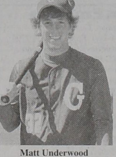
First Team All District