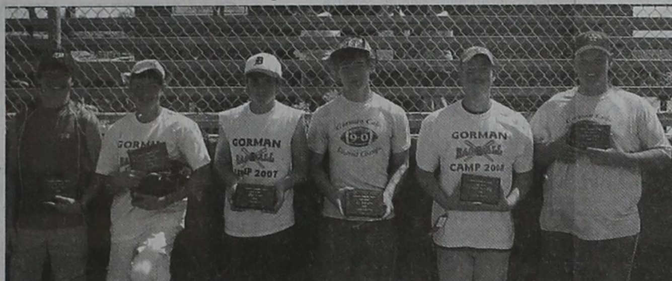
"Old Timers" - The ones that have been to most of Coach Fox's Baseball Camps.