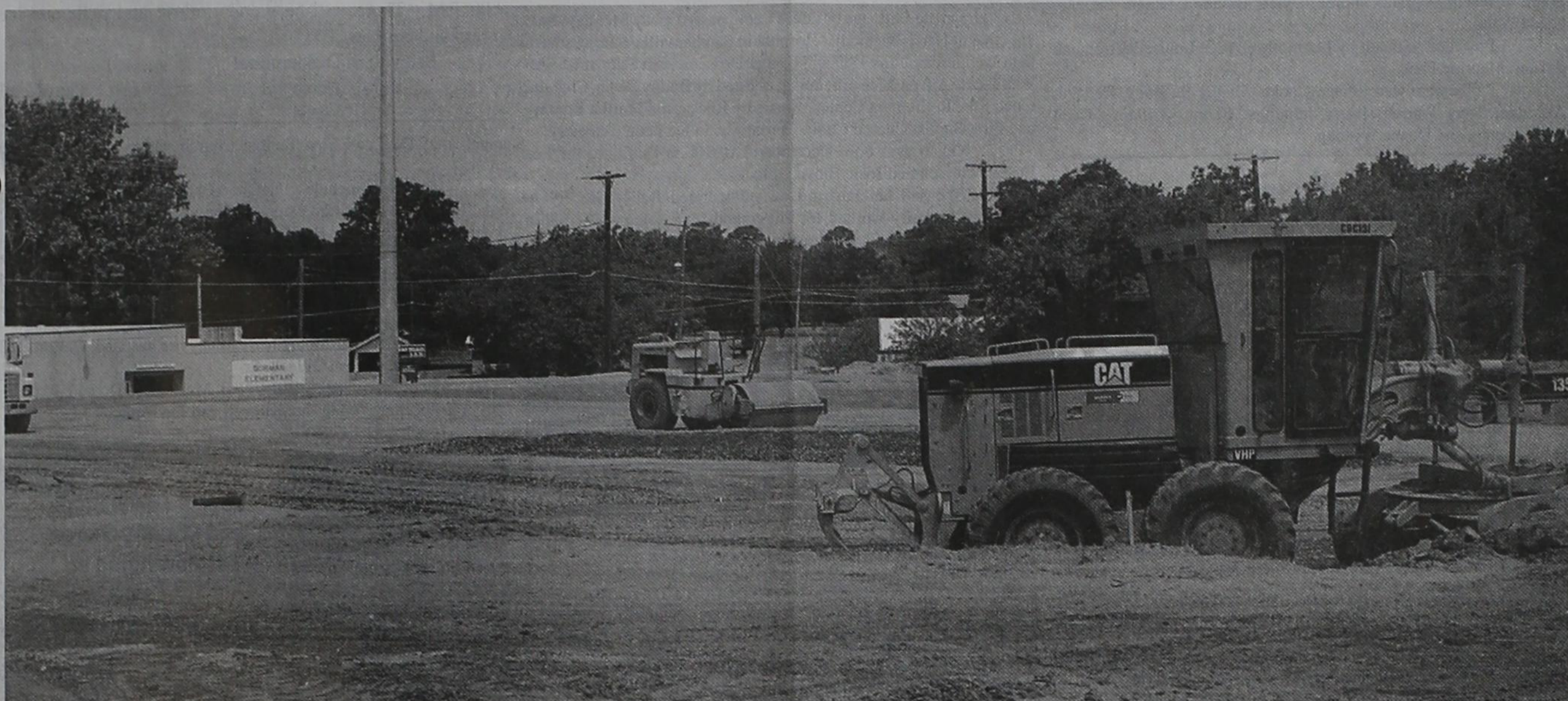
Land work continues on the new gym and classrooms for Gorman Schools.