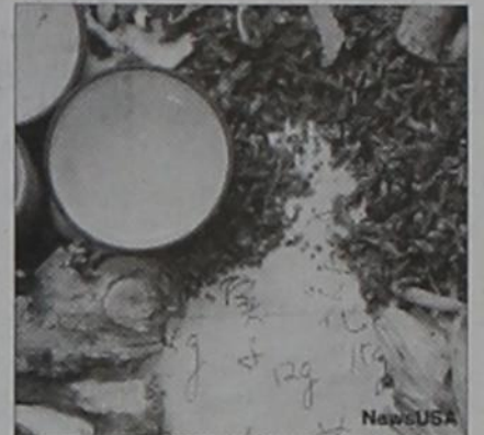
More Americans are turning to herbs, not drugs, to address health issues.

Luckily, patients don't need to travel cross-continent to find these