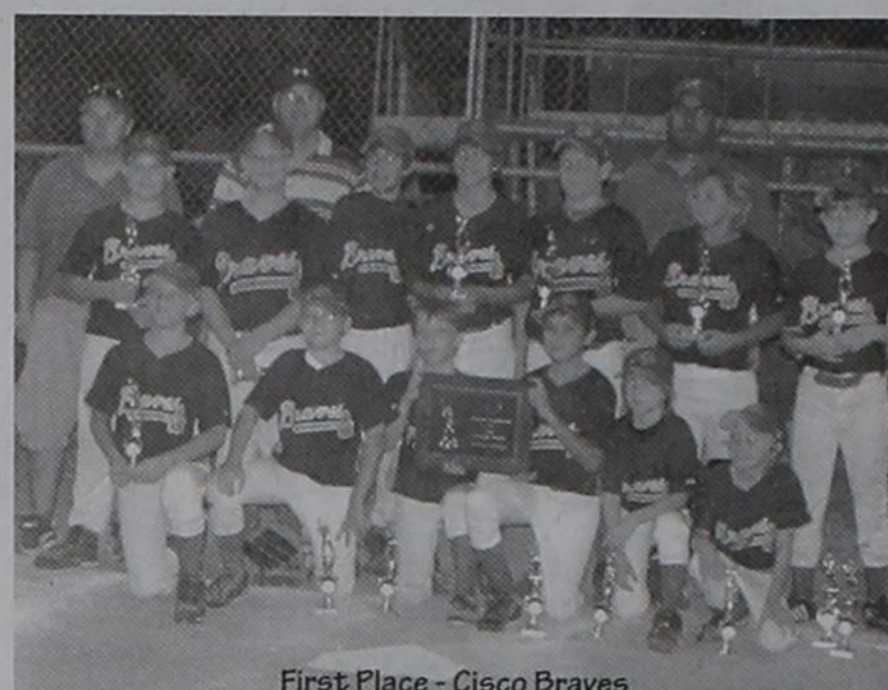
First Place - Cisco Braves