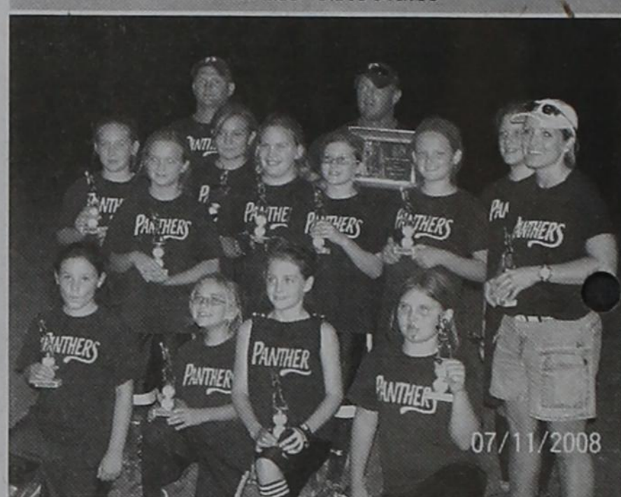
Second Place - Brownwood Panthers