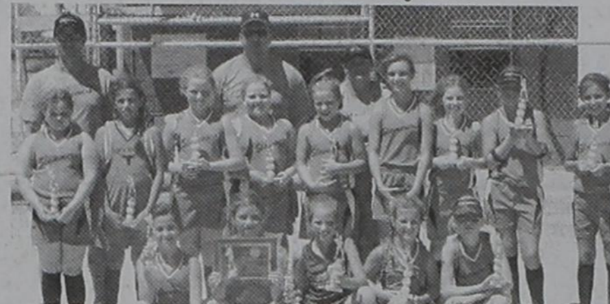
Third Place - De Leon Slammers