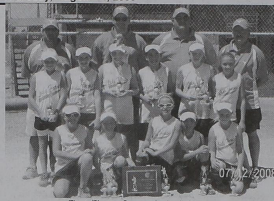
First Place - Comanche Lady Horns