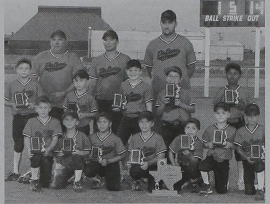
Congratulations To The Boys and Coaches!