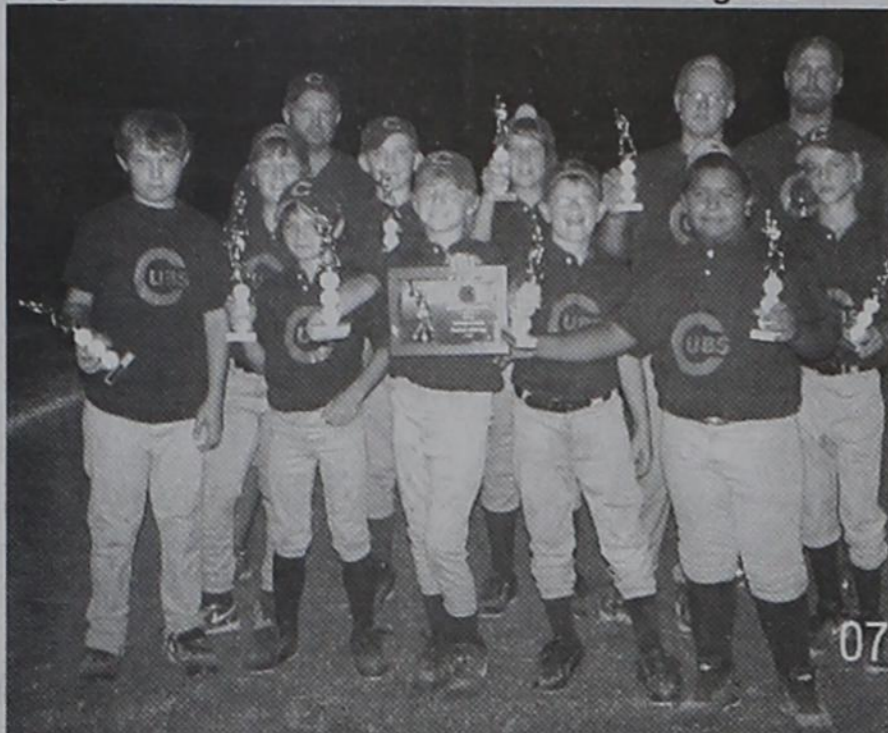
2nd Place - Ranger Cubs