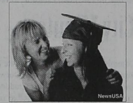
a gift that has meaning or intrinsic value.

Buy something for the graduate's desk. A high-school graduate can use any desk supplies to study, while a college graduate can place items like paperweights on their office desk. An engraved pen holder will make a memorable addition to any desk. PlaqueMaker Plus makes it fast and easy for customers to custom engrave a name, date and personal message on a wooden pen holder that includes a pen set, clock and business card holder. Plaque-