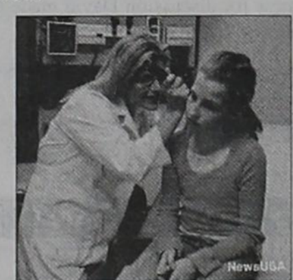
Make sure your kids have a sports physical before engaging in summer activities.

physical exam to ensure they're physically ready to be active. Take Care Clinics, professional walk-in health care clinics located at select Walgreens across the country, are now offering sport