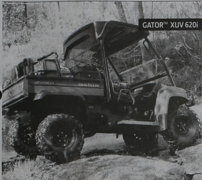
GATOR™ XUV 620i